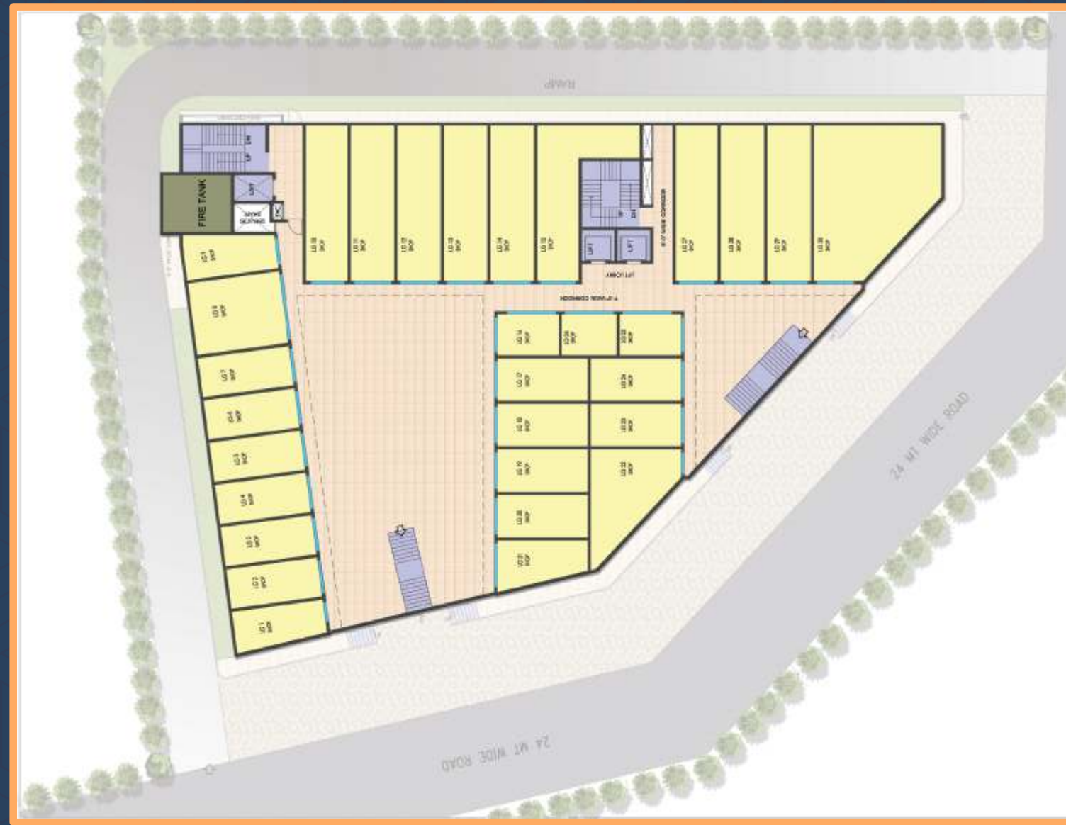
LOWER GROUND FLOOR PLAN