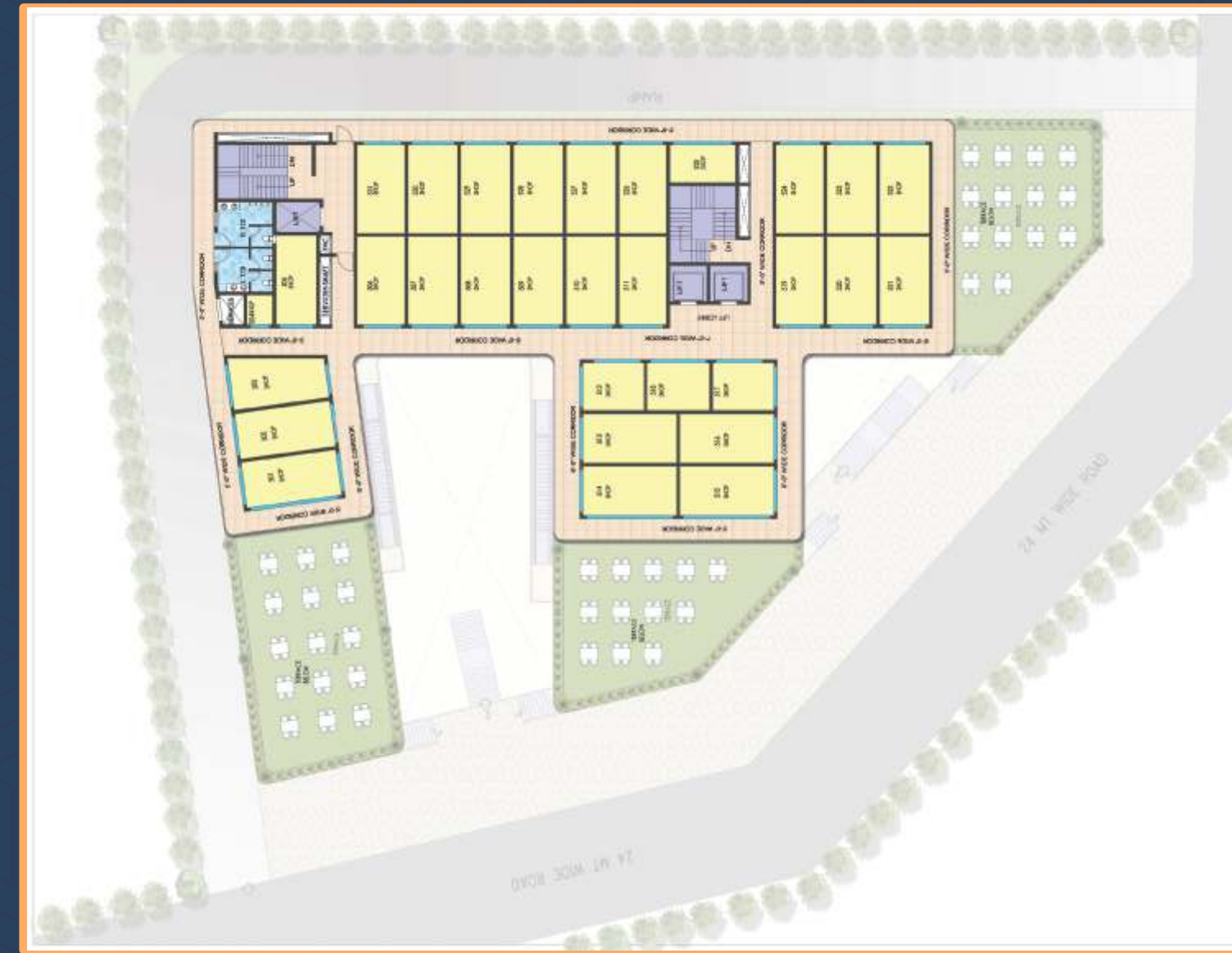
FIFTH FLOOR PLAN